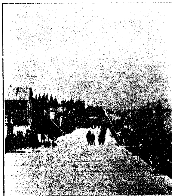
MAIN STREET, BELLA BELLA I. R.